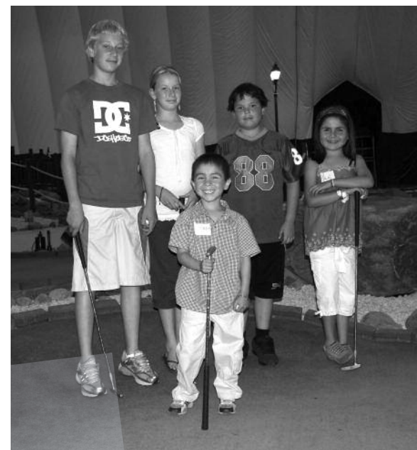
NWOR kids having fun at mini putt

This interactive evening was a positive introduction to the Passport to Well-Being Program. It provided an opportunity for members to get to know one another and encouraged them to return for future programming.